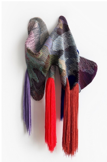
Vanessa Valerio, Dissolving Time , 2025. Textile, tapestry, 110 x 90 x 15 cm.