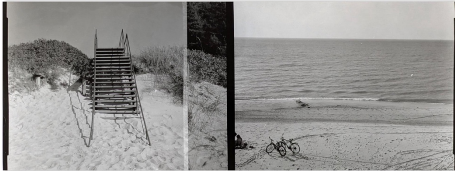
Gintautas Trimakas, Exits , 2012-13. Silver bromide prints, 22 x 55 cm. Courtesy of the artist and Meno Parkas Gallery.