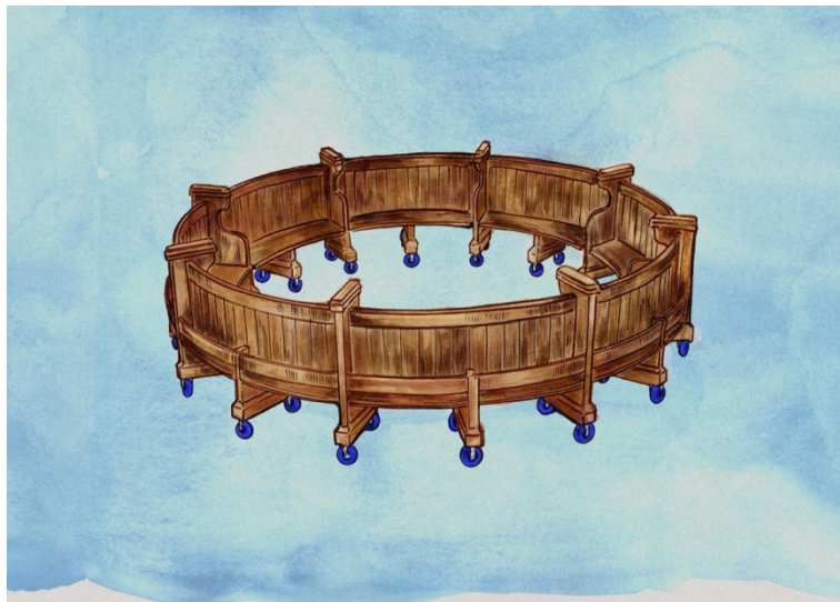
OrangeTerry, Found Faith (preparatory study), 2026.

Art Central reaffirms the role of the Yi Tai Sculpture and Installation Projects as a platform for artists to create works that extend beyond the limitations of the gallery booth. The 2026 edition will feature five ambitious new installations, including projects by three Hong Kong artists.