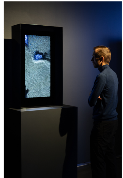
Marta Fréjuté, Curiosity , 2022. Neon lamp, 35 x 75 x 6 cm. Photo by A. Vasilenko. Courtesy of the artist and Meno Parkas Gallery (Left); Installation view of Sunken Echoes by Alexis Wong, 2026. Mixed-media interactive installation, size variable. Photo by Ian Wallman. Courtesy of the artist and Yiwei Gallery (Center); Installation view of Transenlight-Four Emissaries by Jansword Zhu, 2024. Video art installation, stainless steel, 1'52", 104.8 x 72 x 60 cm. Courtesy of the artist and Astra Art. (Right)

Hong Kong, 20 January 2026 – Art Central, together with Lead Partner UOB, unveils the first wave of artist and project highlights for its eleventh edition, spotlighting breakthrough voices and internationally recognised practices across its 2026 gallery programme. A cornerstone of Hong Kong Art Month, the Fair will be held from 25 to 29 March 2026, with a VIP Preview on 24 March, at its iconic Central Harbourfront location.