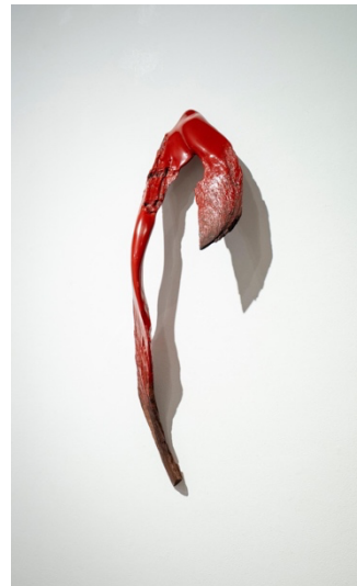
Kohei Ukai, Connect II , 2025. Camphor wood, hemp, urushi lacquer, 25 x 95 x 15 cm.