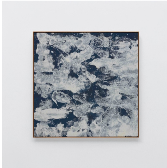
Ma Kelu, Ada Silver , 2017. Oil on canvas, 146 x 146 cm.

Neo reinforces Art Central as a launchpad for new talent, connecting collectors and audiences with artists advancing into pivotal phases of their practice while spotlighting compelling voices shaping contemporary art across generations and geographies. The 2026 Neo sector features six returning galleries and welcomes four new participants, each showcasing artists new to Art Central, including: