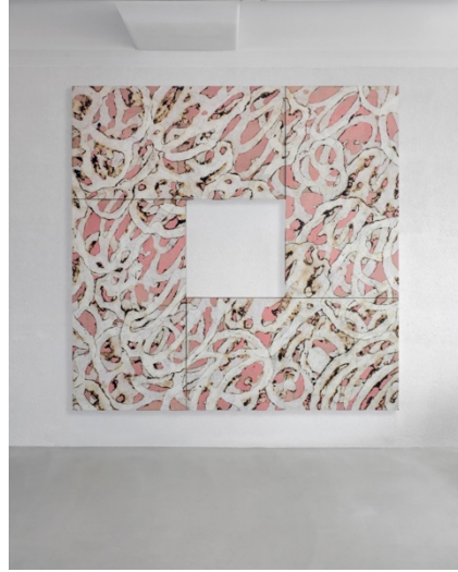
Casper Kang, Star 271 , 2023. Burnt hanji, ottchil hanji, fluorescent magenta acrylic on linen hemp, 230 x 230 cm.