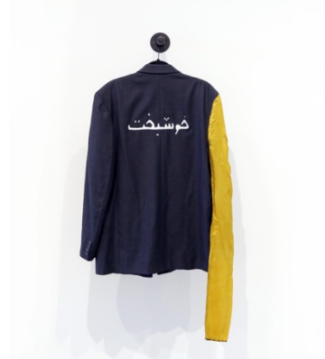
Elnaz Javani, Lucky (Limited Series The Fate) , 2013. Hand-embroidered on the outer layer of an M-size men's coat, applique and thread, 180 x 90 cm each.