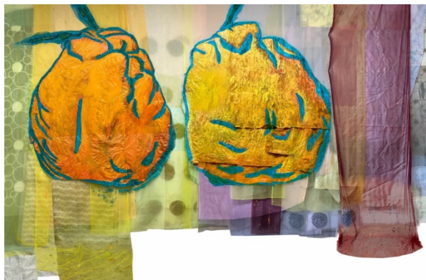
Jeong-A Bang, The Space Between Us (detail), 2025–26. Acrylic on a translucent cloth, 400 x 650 cm. Courtesy of the artist and Gallery MAC.