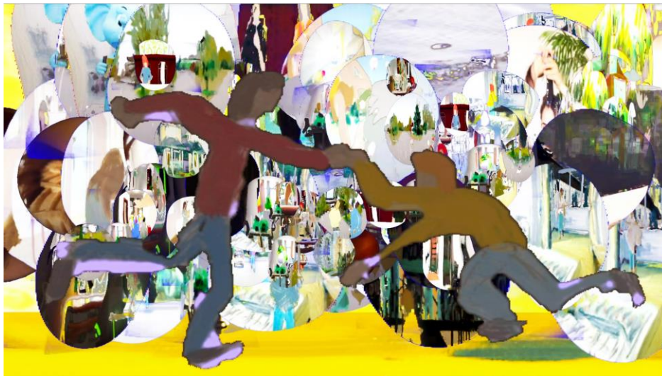
Yifan Jang, One Sunday Morning , 2021. Single-channel animated video, 13'12".

Championing the breadth of contemporary moving-image practices from the region and beyond, the Fair’s 2026 programme of Video Art, ‘ Reading the Room ’, turns toward the subtleties of human interaction and the labour of meaning-making. Observing how artificial intelligence routinely processes vast datasets yet struggles to apprehend nuance, subtext, and tone, the programme reframes this technological shortfall as an analogue for the misalignments inherent in everyday communication, foregrounding the tensions, hesitations, and emotional undercurrents that contour our attempts to understand one another.