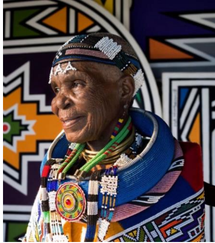
Esther Mahlangu.