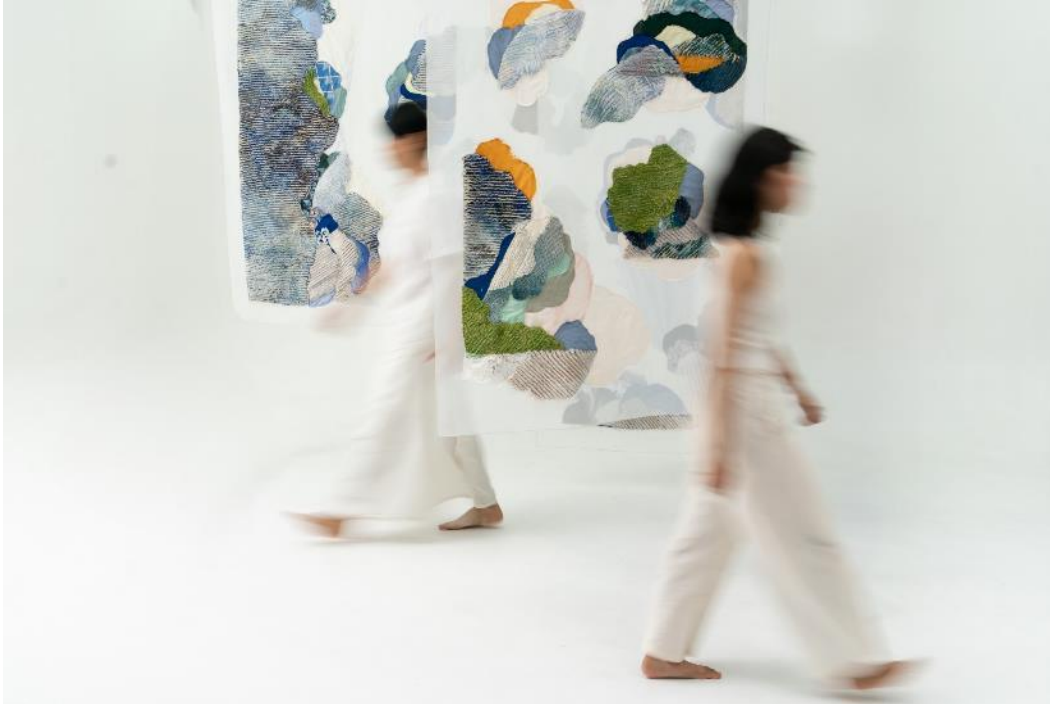
Irene Febry, Bhumi Series (Taman – Garden) , 2025. Mixed Media, various dimensions.

Contemporary art in Indonesia today unfolds as a manifold practice in motion, where historical reflection and material intelligence intersect with the complexities of contemporary urban life. Its ecosystem grows from critical discourse and emerging sensibilities that continually inform and reshape one another. Art Central partners with Indonesia's National Talent Management for Arts and Culture (MTN Seni Budaya) to present ' Rising Currents ', a curated constellation of eight leading Indonesian galleries: EDSU house, Galeri Ruang Dini, ISA Art Gallery, Puri Art Gallery, RUCI Art Space, SAL PROJECT, SEWU SATU, and V&V.